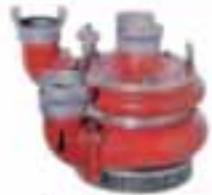
Turbo-pompes gros débit