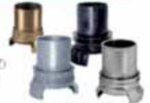
Demi-raccords à verrou