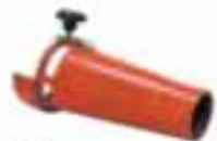
Embouts mousse bas foisonnement