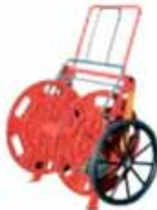
Dévidoirs à roues 200 m