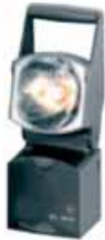
Lampes portables Projecteurs portatifs