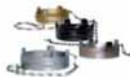
Bouchons avec chaînettes