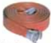
Flexibles d'incendie : refoulement