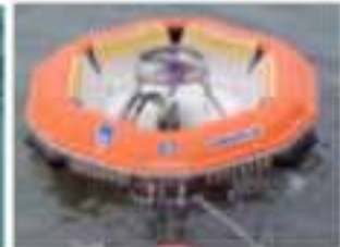
Tête KOMARA 40

For all request concern skimmer, please contact us