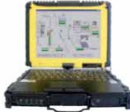
Ordinateurs de bureau, Pockets PC, transpondeurs