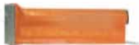
INLAND 10 : 10 x 15 cm