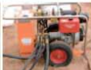
Groupe KOMARA DUO