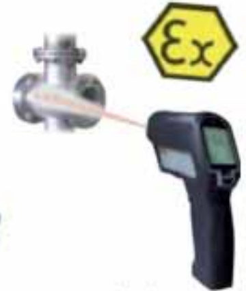
Appareils de mesures, calibrateurs