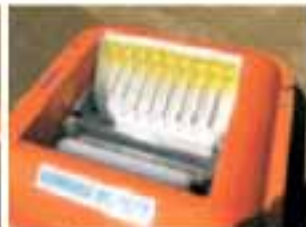
Tête KOMARA DUO