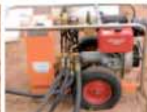
Groupe KOMARA 20