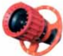
Tête de diffusion 3000 l/min à 6 bar débits et jets réglables