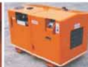
Groupe KOMARA 40

For all request concern skimmer, please contact us