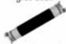
Tuyaux d'incendie : aspiration