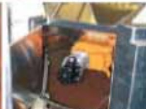
Pompe KOMARA 40