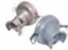
Coupleurs de vidange