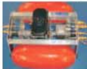
Pompe KOMARA DUO