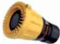
Têtes de diffusion à régulation automatique de pression et jets réglables