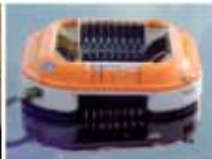
Tête KOMARA 20