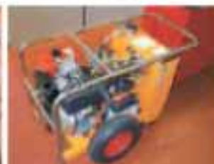
Groupe KOMARA MIDI