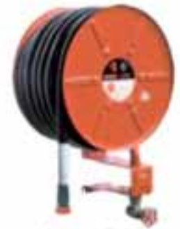
Robinetts d'Incendie Armés (RIA)