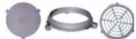
Raccords de ventilation