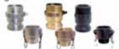
Raccords à cames